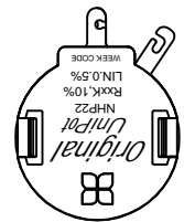
REAR SIDE VIEW