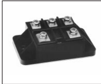
RM20TPM-24, RM20TPM-2H Three-Phase Diode Bridge Modules 40 Amperes/1200-1600 Volts